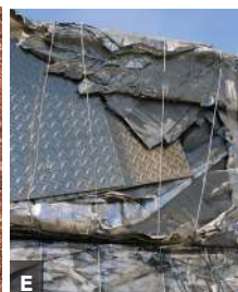
The above photos are representative of the wide variety of recycled metals that OmniSource buys and sells.